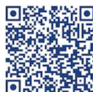
AFPC Total Force Service Center