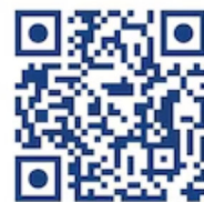
U.S. Office of Personnel Management