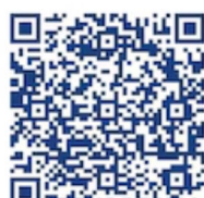
Military Leaders Economic Security Toolkit