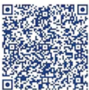
Agency Contingency Plan Guidance

Check your local commissary status online. Some non-appropriated fund services may continue.